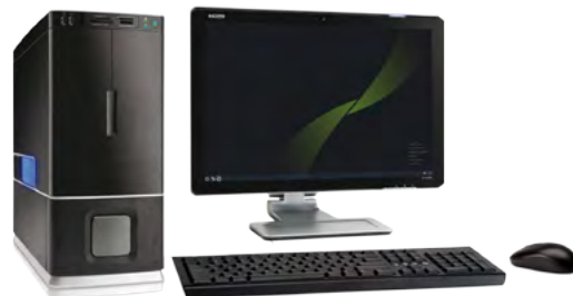
ThinOX4PC - PC to thin client conversion system

Therefore, replacing with thin clients was not possible in this instance. The customer also needed to migrate to the application system provided by SBA in the shortest possible time.