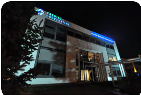
The headquarter of SBA - Servizi Bancari Associati